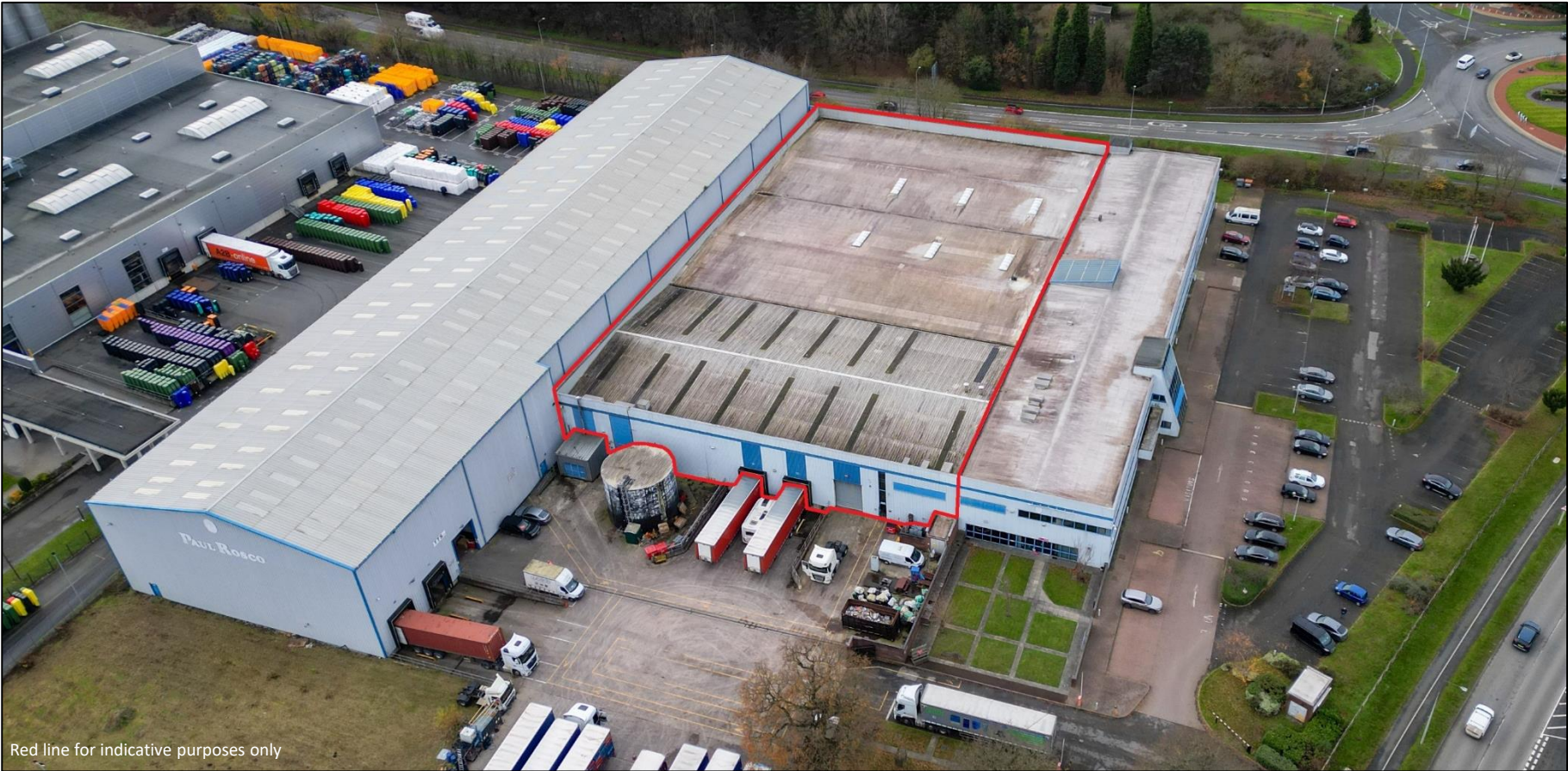
Red line for indicative purposes only