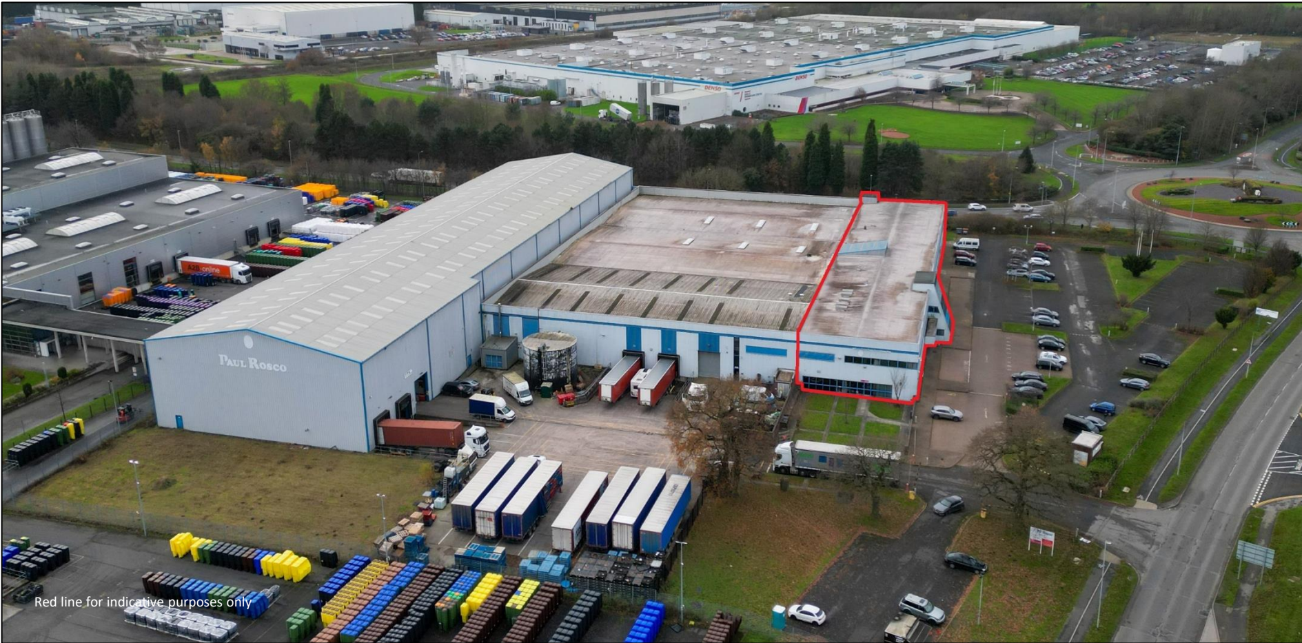
Red line for indicative purposes only